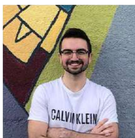
Matt Miller Videography & Digital Media